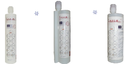
VMK-SF 280-Winter VMK-SF 345-Winter VMK-SF 380-Winter